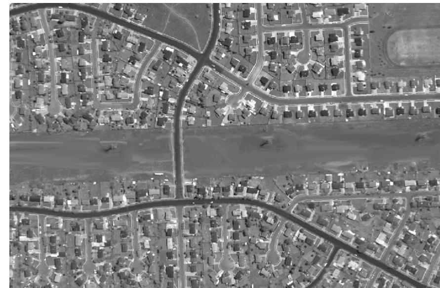
Aerial view of an ideal easement in a developed area

The following Kern River specifications are minimum requirements for most proposed encroachments to maintain the safety and reliability of the pipelines and to avoid conflicts with U.S. Department of Transportation regulations and existing right of way agreements. Additional requirements may be imposed, depending upon the scope of the proposed encroachment and the existing Kern River easement rights. For a review of your individual situation, please contact your local Kern River office.